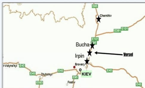
THE RUSSIANS DEVASTATED BUCHA & IRPIN RANDOMLY KILLING CIVILIANS & LEAVING THEIR BODIES IN THE STREETS