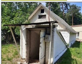
THIS IS THEIR BOMB SHELTER, OR AS THE DIRECTOR CALLS IT TO THE CHILDREN, "THEIR" HIDING PLACE"