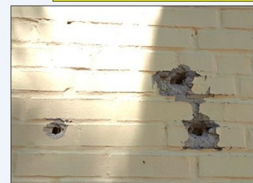
EXAMPLE OF BULLET HOLES THEY FOUND IN ORPHANAGE WALLS WHEN THEY RETURNED