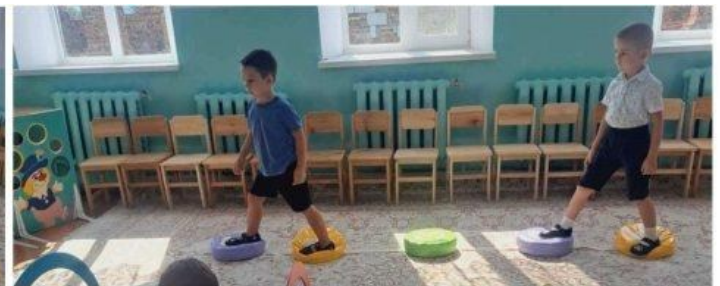
SENSORY & PHYSICAL ACTIVITY TOOLS FOR THE ORPHANAGE P.E. ROOM