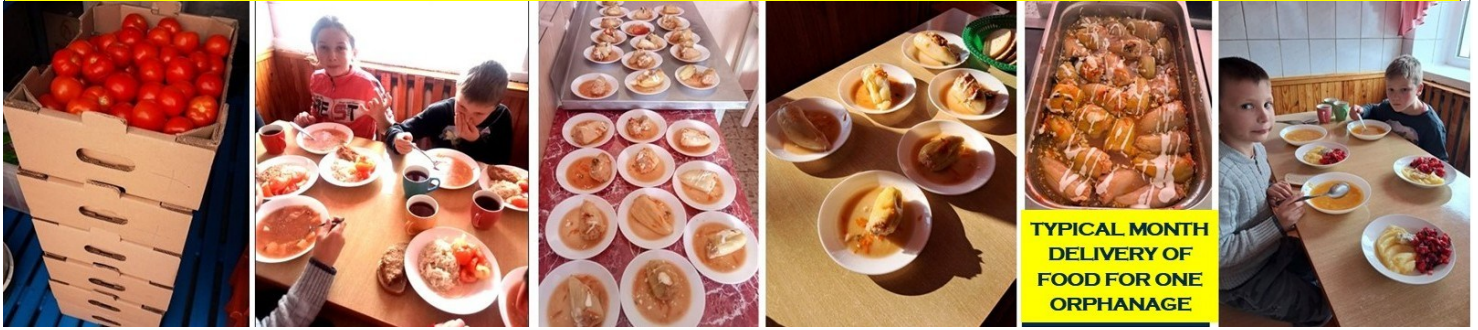
TYPICAL MONTH DELIVERY OF FOOD FOR ONE ORPHANAGE

YOUR FINANCIAL SUPPORT HELPS TO MAKE THEIR TRIPS POSSIBLE, IN ADDITION TO THE MATERIAL HELP WE BRING: MEDICINES, FOOD, CLOTHES, ETC.